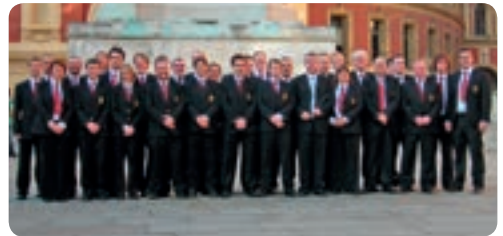
ROTHWELL TEMPERANCE BRASS BAND