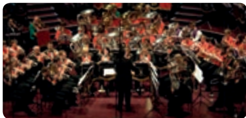
THE BLACK DYKE BAND